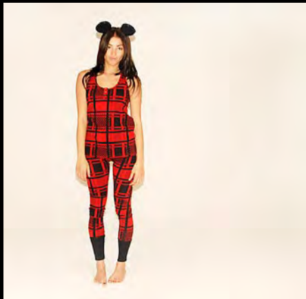
Blood Runner Legging