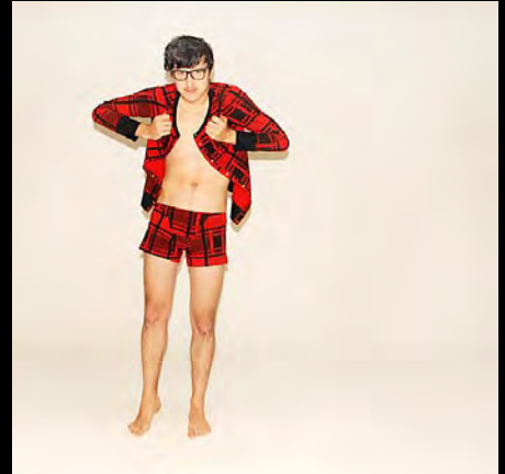
It's Plaid To See Cardy