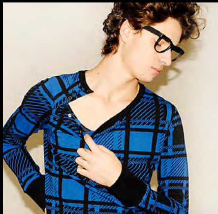
Galaxy Goanna Pj Top