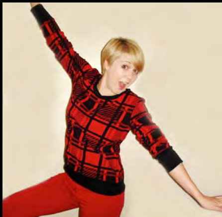
Space Koala Pj Top