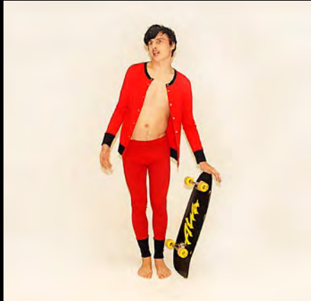
Red Rider Cardy