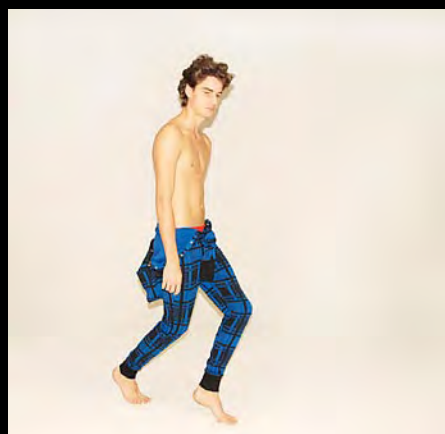
Booboo Toddy Suit