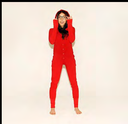
Redrum Toddy Suit

Drift gently into the fright with 'Log Cabin Lullaby'.