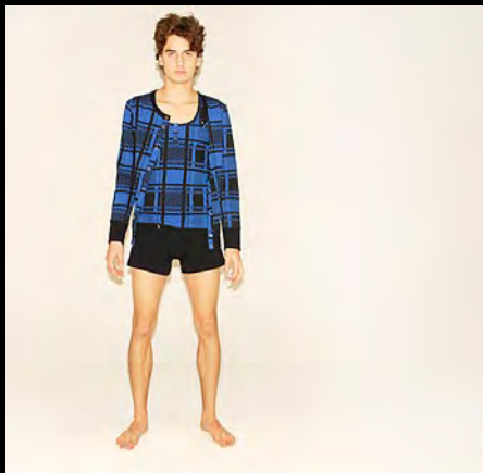
Cook Me Eggs Shorties