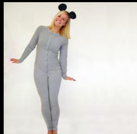
Frogger Toddy Suit