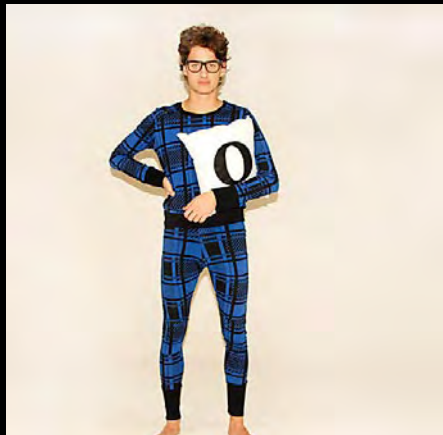
Orgen Borgen Legging