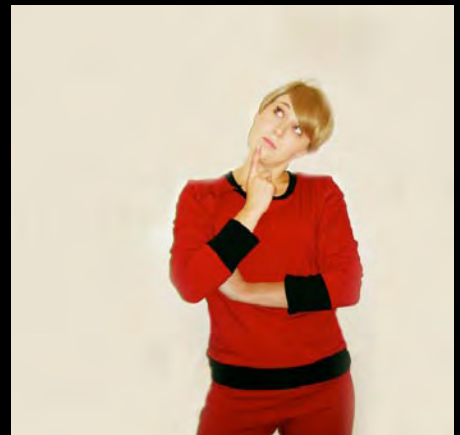
Mars Invades Pj Top