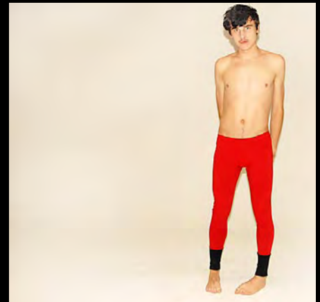
Rootin' Tootin' Legging