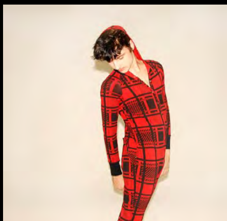
Roary Toddy Suit